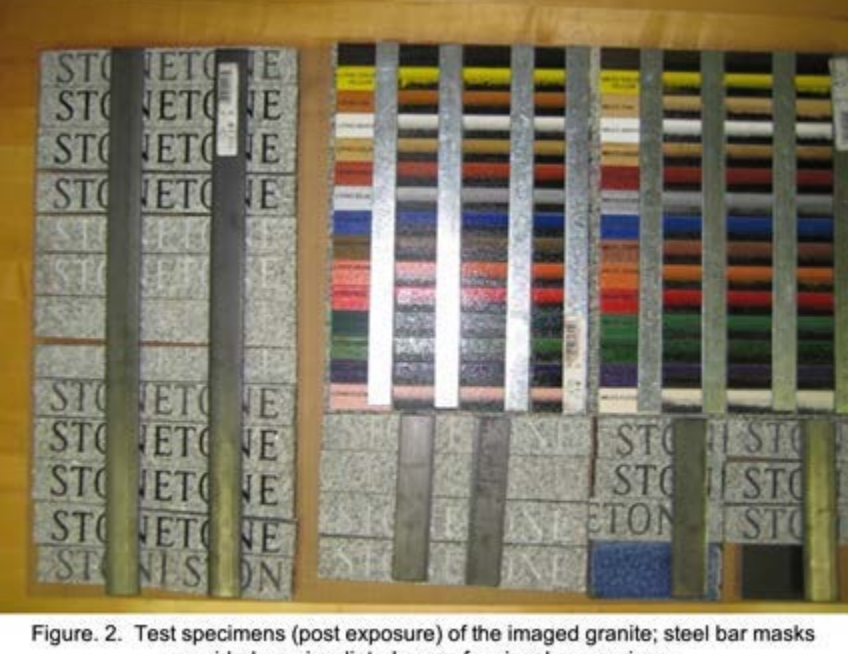
provided non-irradiated areas for visual comparison.

the product was successfully introduced (www.graniteimaging.com). While not a conventional approach to weathering, the required time and expense mandated a reasonable alternative approach, and although not a complete validation of 100+ year durability, the project provided sufficient assurance to support the manufacturer's market claims.