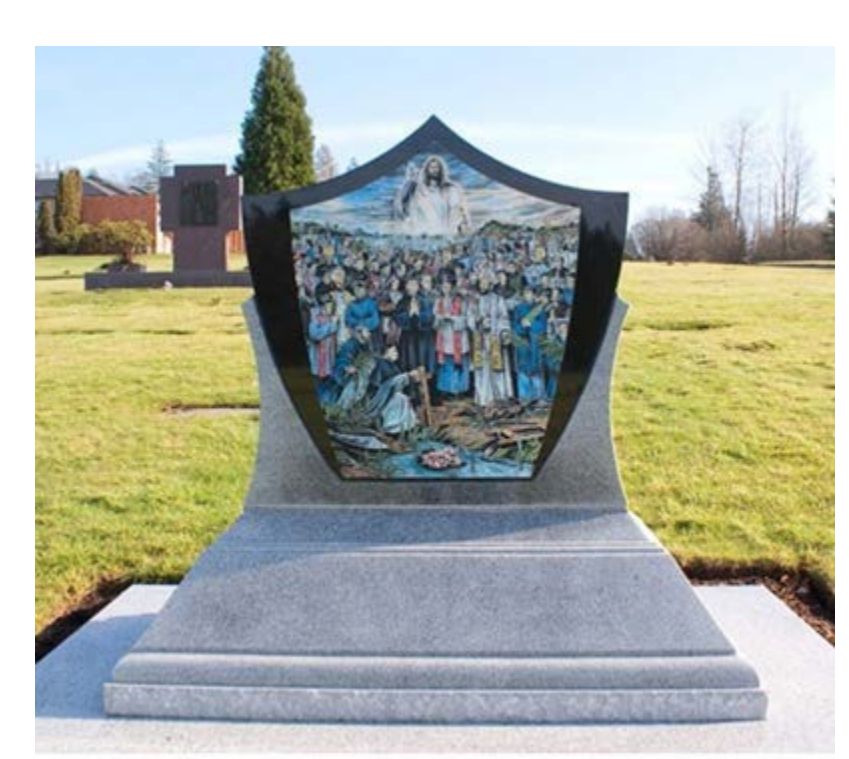
Figure 1. An example of the color-imaged granite monument

Evaluating the characteristics and probable failure modes of the finished product, and the results of preliminary screening studies, it was revealed that neither moisture nor temperature effects were likely to degrade the image. Instead, the long term cumulative exposure to sunlight was identified as the most likely stress to result in image degradation.